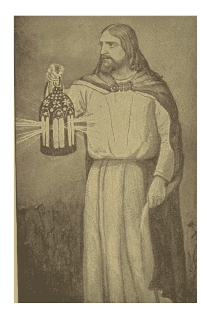
The Light of the World