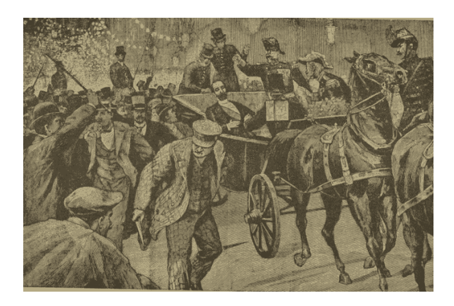
Assassination of Carnot.

The times we live in are anomalous to any that have ever preceded us. For some years there have been universal and active preparations for war, and almost universal peace. To secure the greatest efficiency of armed forces for defensive and offensive purposes, has been the prime consideration of government, especially so, as far as the Old World nations are concerned. Europe echoes to the tread of vast hosts of war while the nations are driven to their wits' end to provide for their support. It is well known that these costly preparations are not for show; and the hearts of men quail in view of the culmination which, though delayed, must soon be reached.