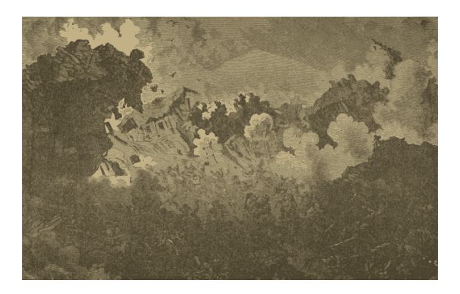
The Day of Wrath.

Most dreadful day! and is it near?—Yes; it hasteth! It hasteth greatly! What a description given by the prophet! Read it; and as you read, try to realize how dreadful will be that day:—