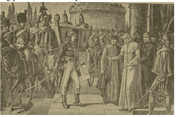
Taking the Pope Prisoner. 1798.

The prophet Daniel saw the papacy, its blasphemy, its ignorance, its work of death on the saints, and its duration as a persecuting power, under the symbol of the little horn.