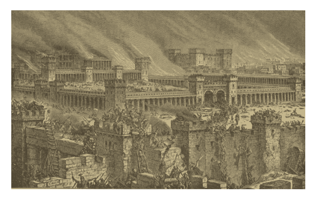
Destruction of Jerusalem by Titus

"And the people of the prince that shall come shall destroy the city and the sanctuary; and the end thereof shall be with a flood, and unto the end of the war desolations are determined.... And for the over-spreading of abominations he shall make it desolate, even until the consummation, and that determined shall be poured upon the desolate." Margin, "desolator." Dan. 9:26, 27.