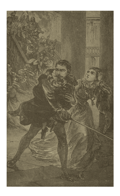
St. Bartholomew Massacre.