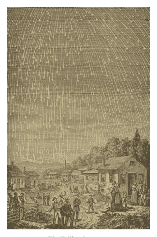
The Falling Stars.