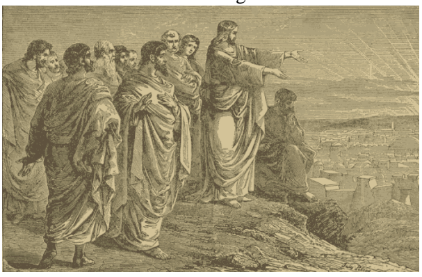
Christ Weeping Over Jerusalem

We accept the Bible as a revelation from heaven. What God has revealed in that book, let no man call a mystery, or a secret of